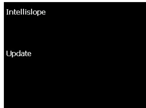
Figure 2: CDU will display "Update".

Gradient Inc. 3260 Red Barn Road Terre Haute, Indiana 47805